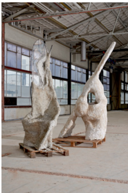
WAIT! It didn't go like that: Starting together, passing the other. We kind of move. You know?, 2021