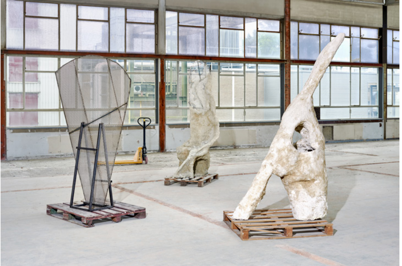
Lifetimes Lived Apart Triptych, 2021