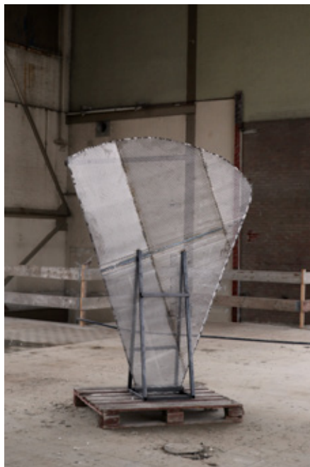
We may have lost some of the signification, 2021 Image by Seung Hwhan Ji ( left )