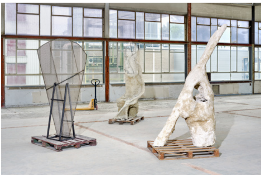
Lifetimes Lived Apart Triptych, 2021